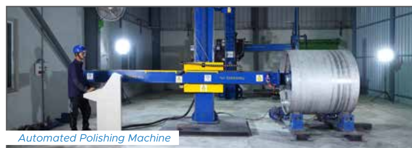
Automated Polishing Machine