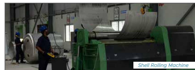
Shell Rolling Machine