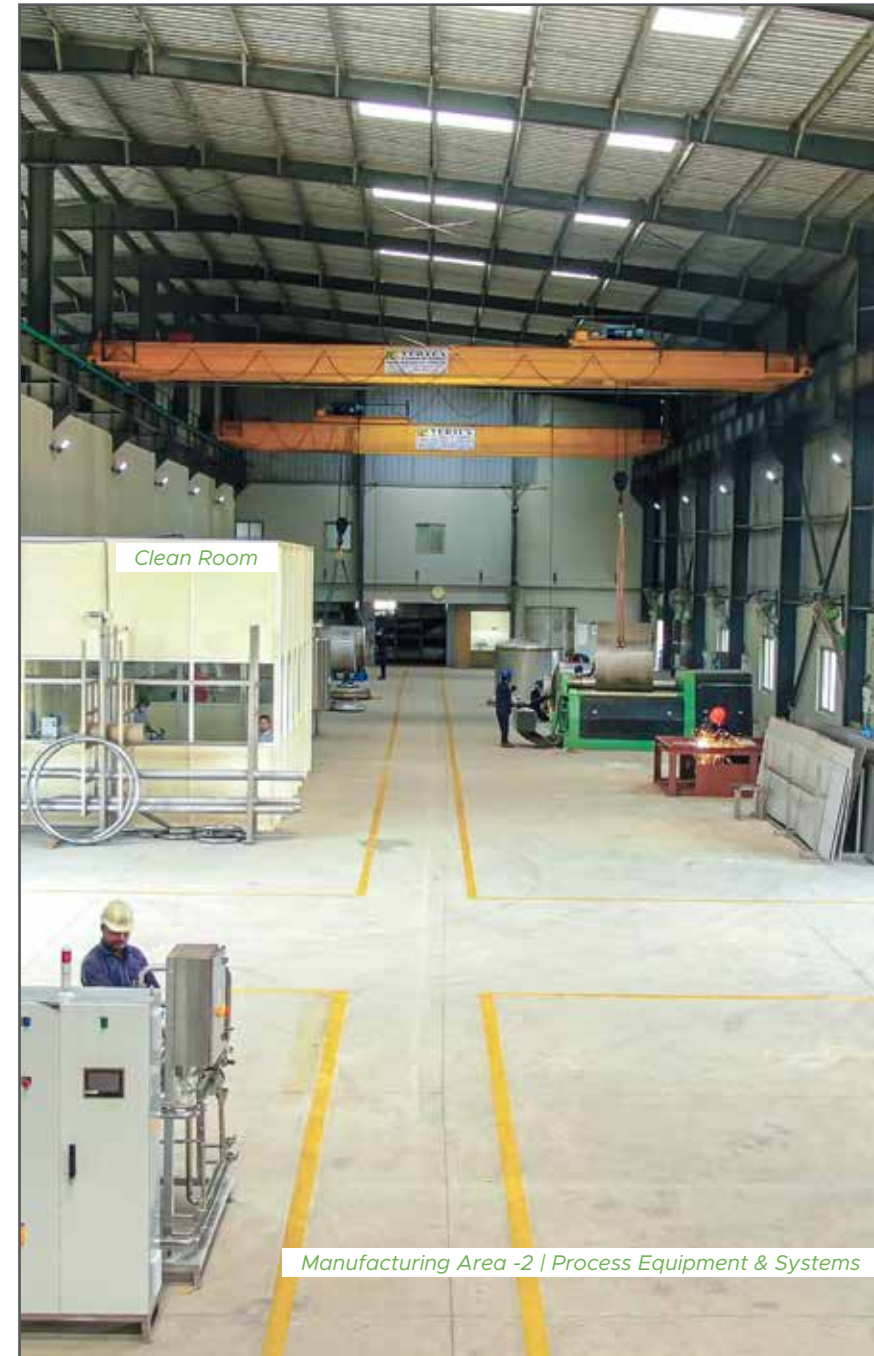
Manufacturing Area -2 | Process Equipment & Systems