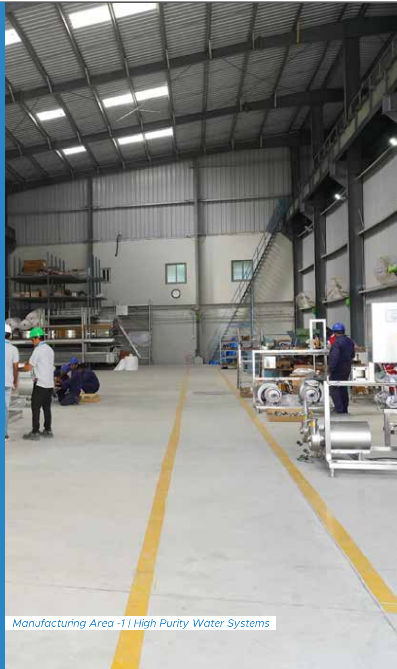
Manufacturing Area -1 | High Purity Water Systems

With in-house electropolishing facility, we are also amongst very few with fully integrated facility in India.