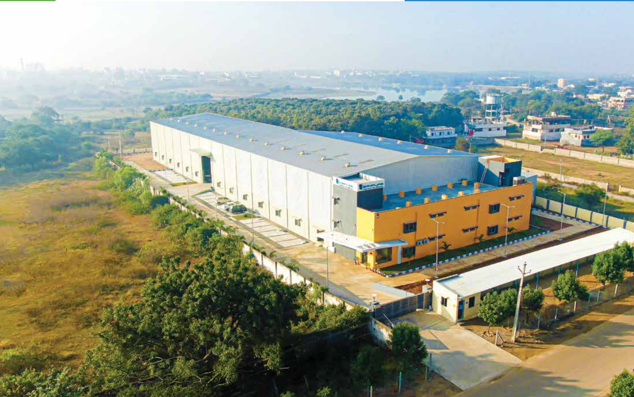
Manufacturing Unit, Gaddapotharam, Hyderabad, India